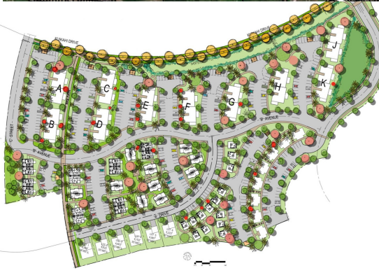
If you would like more information or to sign up for updates, please go to https://alaula.org/kuikahi