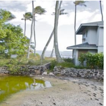
Left-Kalauha'iha'i Fishpond, 1980's