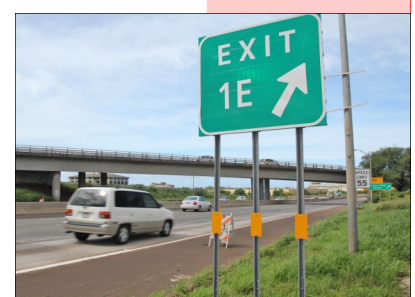
In addition to the Makakilo on-ramp, Phase I also includes a new H-1 westbound off-ramp, pictured here.

backups. While this may not completely alleviate the temporary traffic back-ups, I hope that motorists will be patient while Phase II is completed, as it will ultimately result in a much better balance of traffic flow throughout our area in the long term. Finally, I would like to urge area motorists to exercise caution and patience not only in the construction zones of Phase II, but in using the newly opened on-ramp and off-ramp, as all drivers grow accustomed to the changes in area traffic patterns.