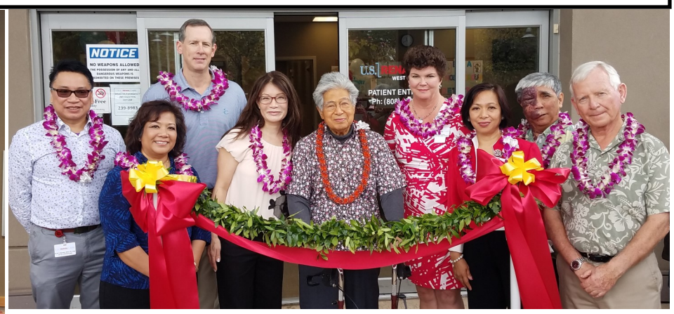
Rep. Har and Senator Daniel Akaka celebrate with U. S. Renal Care—West Oahu on the occasion of their grand opening on January 17, 2017.