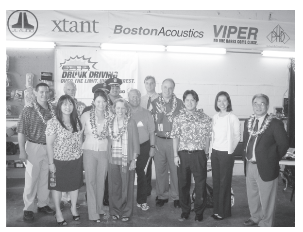
Rep. Har shown with members of law enforcement and Mothers Against Drunk Driving at the opening of the first ignition interlock installation facility in Pearl City.