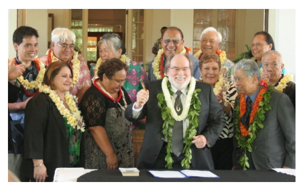
U.S. Senator Akaka, OHA Trustees, and Legislators at the Senate Bill 2786 signing event on April 11, 2012 with Governor Abercrombie