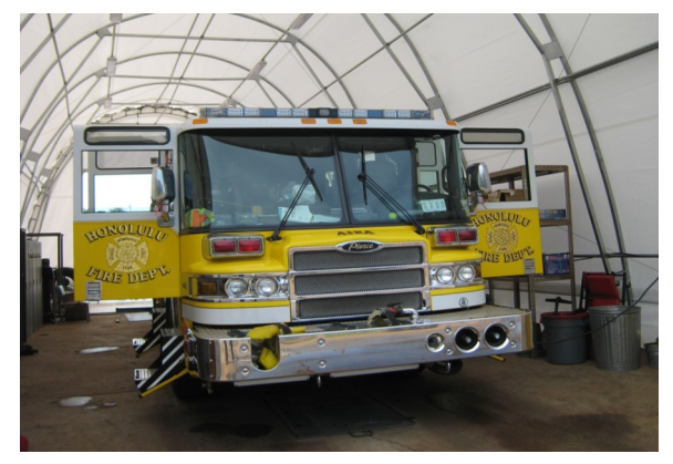
What's in the white tent? The temporary home of 'Aiea Fire Station Engine 10 located at the old 'Aiea Sugar Mill