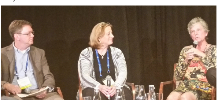
Rep Evans sitting with other panel members to discuss how to encourage people to save for retirement.