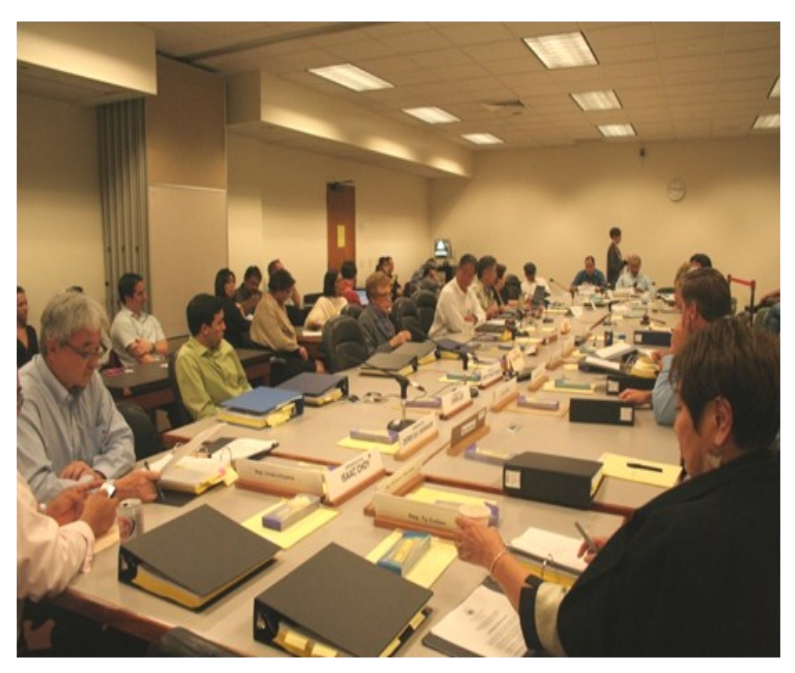
House Finance and Senate Ways and Means Committees meet on final State budget for HB2012.

For the first time in four years, the legislature was not faced with a revenue shortfall. Lawmakers were able to balance the state budget with no major revenue enhancements or cutting support programs and services vital to serving Hawaii's people.