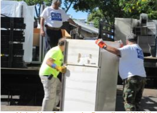
Aloha Aina Community Recycling-10/16/10