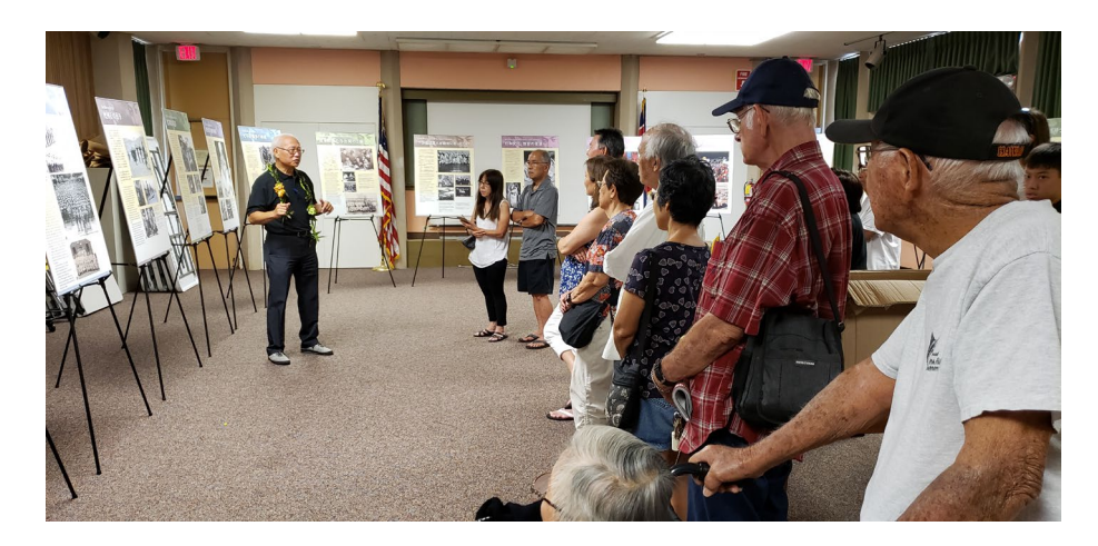
Guided tour at Pearl City Public Library, August 2019.

In 2019, the HNLE was displayed at numerous locations on Oahu. These exhibits were suspended from 2020 to 2022 due to COVID restrictions and are expected to resume as public restrictions have been removed.