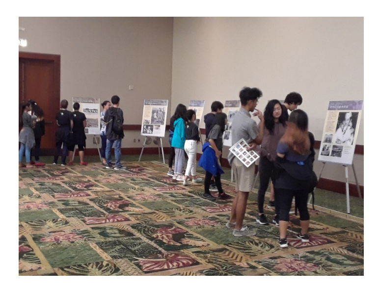
Hawaii High School Students at Honolulu Festival, March 2018.

In 2018, the HNLE toured the State of Hawaii as part of the 150<sup>th</sup> anniversary celebration of the initial Japanese immigration to Hawaii, known as the Gannenmono. The tour was a partnership between the NVL and the Japanese Consulate of Honolulu.