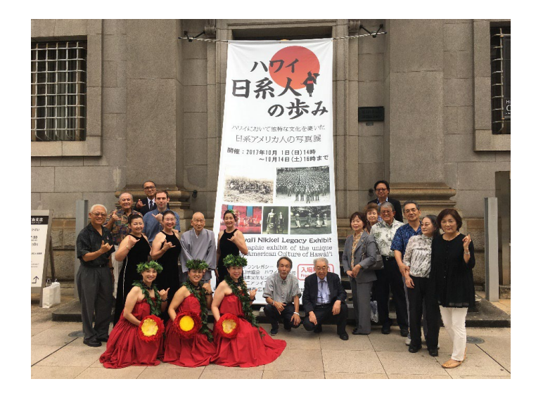
HNLE Opening Ceremony Participants, Hiroshima, November 2017.

We estimated that over 50,000 visitors saw the exhibit at these locations. In addition, several presentations were made to interested audiences on the history and culture of Hawaii AJA.