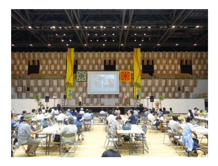
Presentation at Nagaoka City, Japan Auditorium, July 2018.

According to the Japanese Consulate of Honolulu, pre-COVID over 10,000 Japanese middle, high school and university students visited Hawaii each year for educational and cultural exchanges. The NVL has made numerous presentations to some of these student groups including tours of facilities like the 100<sup>th</sup> Infantry Battalion clubhouse.