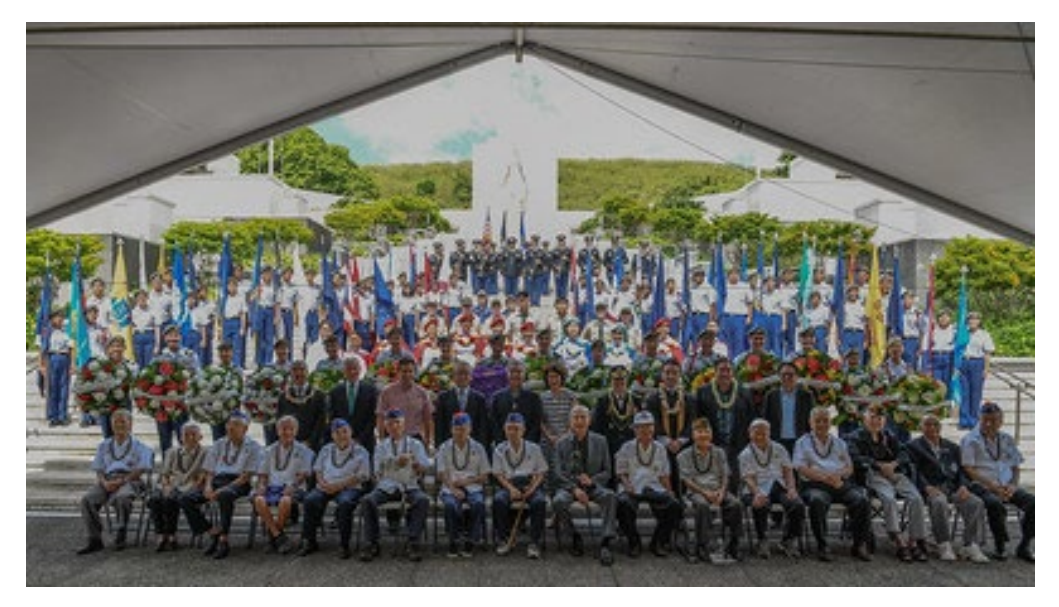
Nisei Soldier Memorial Service participants September 2019.