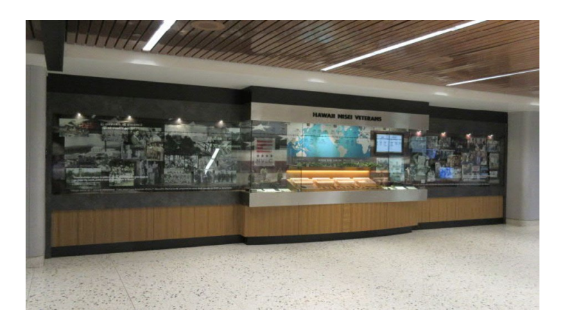
NVL Nisei Soldier Exhibit at DKI Airport.

We expanded our outreach through a significant investment in a permanent airport exhibit located inside Terminal 1 of the Daniel K. Inouye International Airport. The expansive historical exhibit documents the wartime and post war contributions of the Nisei veterans through text, photographs, and artifacts.