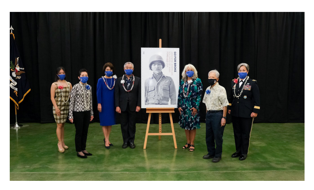
Go For Broke Stamp Unveiling Ceremony, June 2021.

In 2023, the NVN again reached out the NVL for support in coordinating a site visit in December with the National Museum of the United States Army (NMUSA) for preliminary discussions about bringing an exhibit on the Nisei soldiers to Oahu.