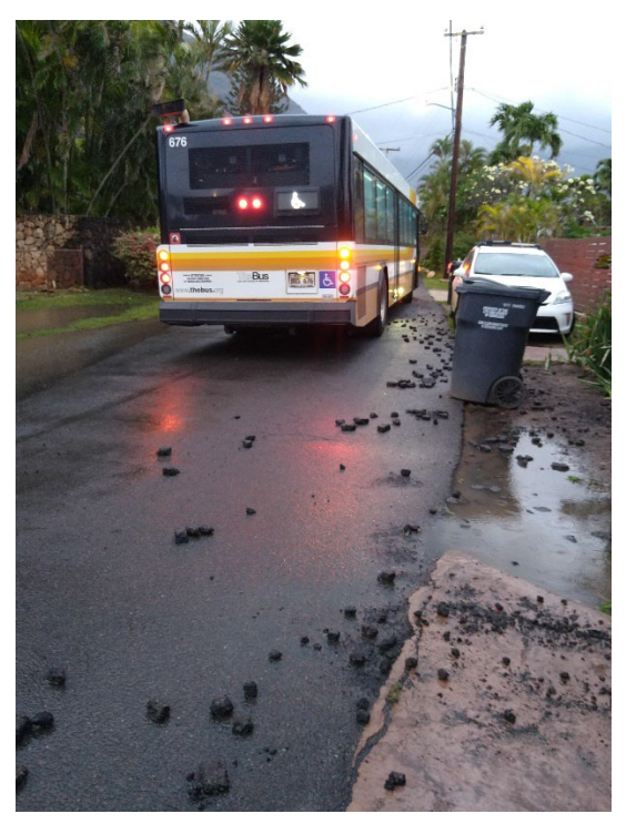
Figure 2. The Bus on Makau Street.

the street (on the grass) to visit friends/family and/or to get to beach access points, so it's generally necessary to walk on the street itself. See Figure 2 which shows The Bus driving on Makau Street. Meanwhile, residents, visitors, children, and families walk, skateboard, and bicycle along Makau Street to enjoy the neighborhood, visit family/neighbors and to access the beach. Kids often play in the street.