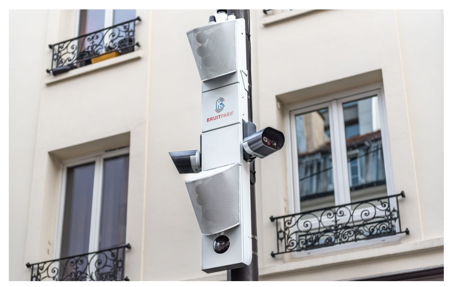
A sound radar device in Paris combines microphones and cameras to detect noise offenders.

The complaints of those living on Rue d'Avron – considered one of the noisiest roads in one of Europe's loudest cities – haven't fallen on deaf ears: In February, municipal authorities <u>installed</u> a device known as sound radar – the first ever in Paris – on a lamppost along the thoroughfare in the city's eastern 20th arrondissement to detect the loudest vehicles. A second was added in the northwestern 17th arrondissement soon after.