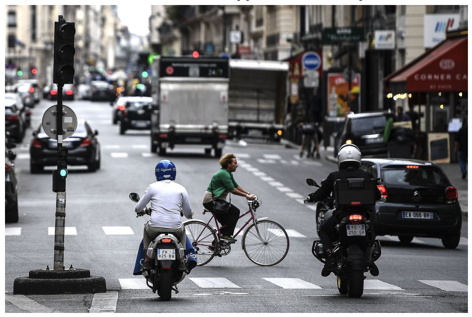
Motorcyclists in Paris are among the offenders targeted in the city's new campaign against noise pollution.