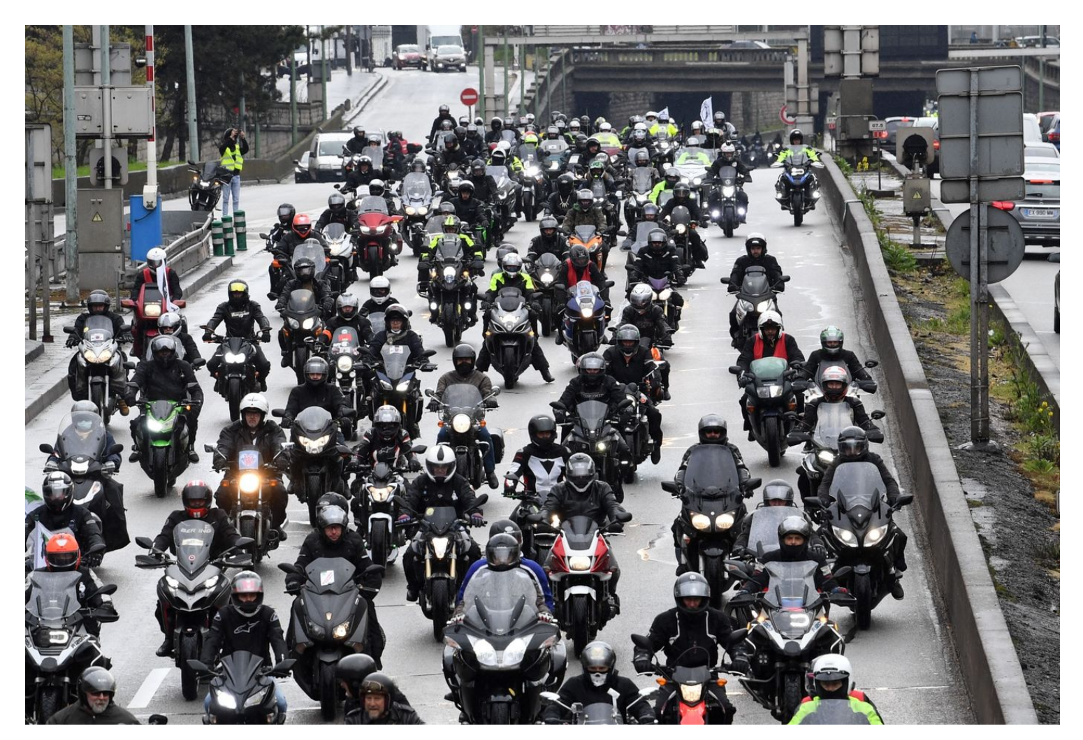
Motorcyclists ride along the périphérique around Paris in April 2021 as they stage a protest against new parking regulations for motorcycles.

But these noise-canceling efforts have also drawn some resistance – especially from motorcycle owners, who staged raucous mass protest rides through Paris in 2021 to protest new parking charges, speed limits and other measures.