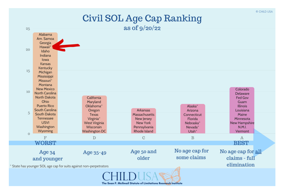
HB 582's civil extension would improve Hawaii's SOL significantly. It is in line with the recent federal changes and the overall trend to give older victims more time to come forward in accordance with the delayed disclosure of abuse science.

In contrast, ten noteworthy states and territories, along with the federal government, have already abolished their age cap for all claims against perpetrators and other defendants. The worst states and territories with age limits that block claims when victims are in their 20's are out of touch with science and the realities child sex abuse trauma. Hawaii is 1 of 13 states with the shortest civil SOLs in the country, cutting off survivors' rights at age 26 or younger.