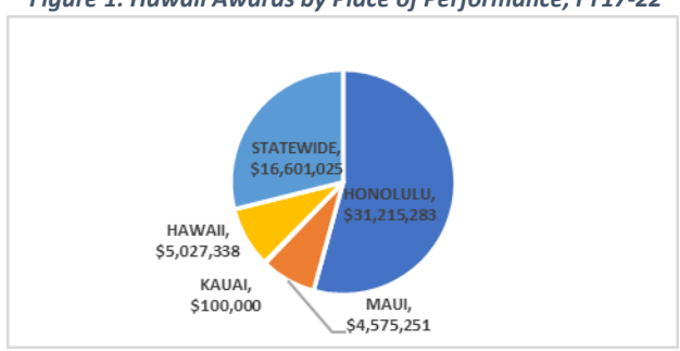
Figure 1: Hawaii Awards by Place of Performance, FY17-22