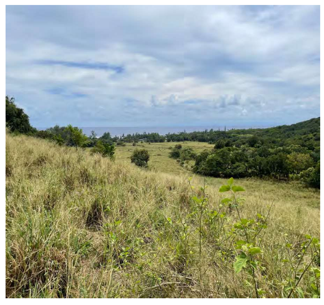
Haneo'o Lands, District of Hāna, Island of Maui (LLCP 2022-03)