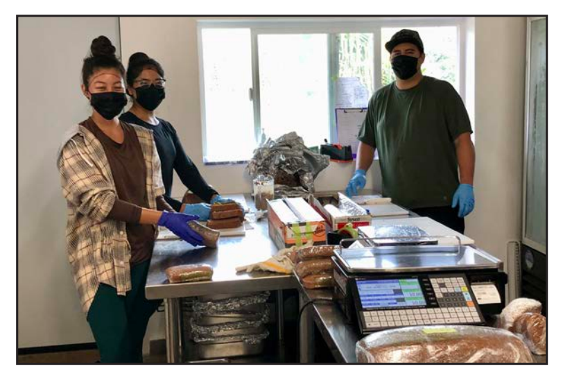
In 2022, KākoʻoʻŌiwi produced over 20,000 lbs. of fresh food.

Community Outreach, Education and Participation: In 2022, 89 schools visited the He'eia Community Development District with approximately 3,500 participants involved in Kāko'o 'Ōiwi activities. There were also 32 community workdays, and 198 volunteer events with over 6,000 volunteers and 20,000 service hours.