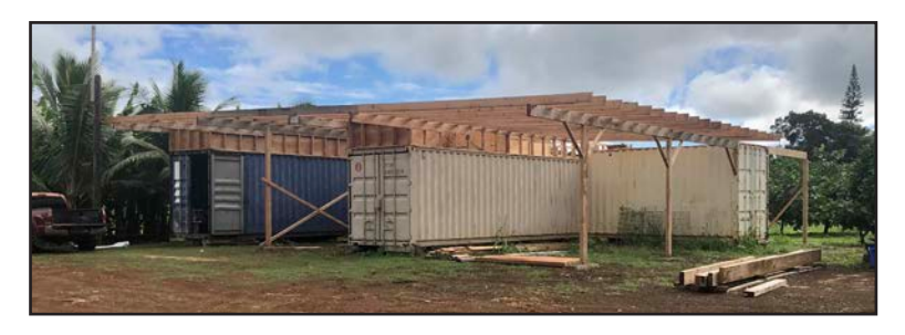
Special projects: The Ho'olauana washpack/rootwash station and the Hale Pepeiao, the mushroom shed construction is underway.