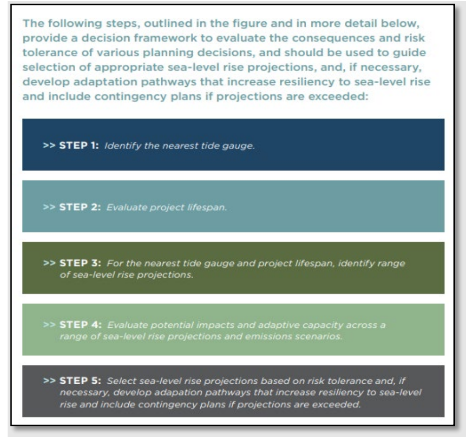
Figure 1: California's "Risk Analysis and Decision Framework"

used when choosing an adaptation approach. Principles include prioritizing social equity, prioritizing protection of coastal habitats and public access, including adaptive planning, etc.