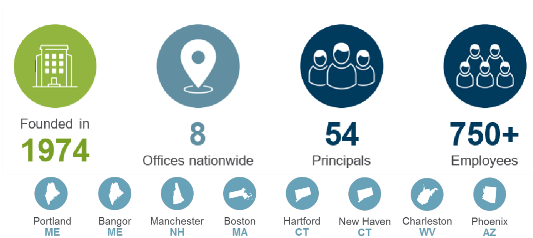
Figure 4-1: BerryDunn Overview

BerryDunn regularly performs audits of IT and business organizations and their processes, as well as the interactions they have with other agencies and departments. Independent audits and project assessments are core to our consulting practice, and our project teams have conducted enterprise-wide strategic risk assessments, project audits, and project health assessments for public-sector clients for more than 32 years.