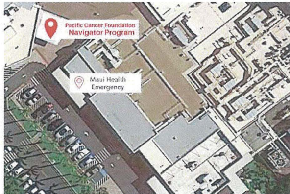
Mahalo to Pacific Cancer Institute for providing space for Pacific Cancer Foundation to operate in this space.