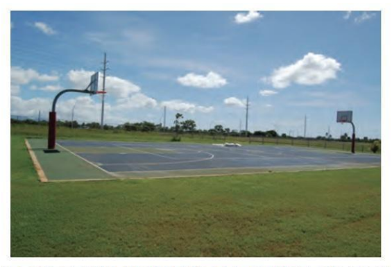
BASKETBALL/VOLLEYBALL COURT: PHASE 1