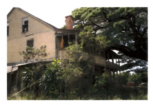
2016/17 Site clean-up. Removal of trees growing near and through lanai. Pruning of significant monkeypod tree. Topographic survey completed. First set of architectural drawings completed. Grading. Planting of food forest.