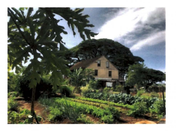
Shingle roof removed. Beams and chimney repaired. New metal roof installed. Supportive scaffolding erected on west side of structure. Grant applications submitted.