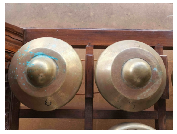
Left: vines grow in behind the plywood installed in front of the corrugated tin walls. Right: bronze gongs tarnish and corrode when protective covers are being laundered due to constant soiling by stray cats.

A charming fact about our property is that it was the first public place in Hilo to be built to accommodate automobiles. But the original designers did not foresee how essential motor vehicles would become. The space is a bit cramped by current standards and definitely not created with accessibility in mind. Before we can engage a contractor to bring the lot up to current standards, we require a design that meets with the approval of our landlord and obtains Disability and Communication Access Board approval.