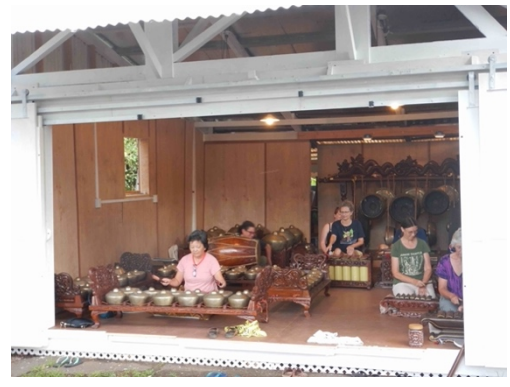
EHCC opened the front of the shed to allow open-air music performances.

In July 2022, EHCC updated its mission statement to declare that its mission is, "To be an inclusive platform for culture and the arts. Through visual and performing arts and education, we give voice to our diverse communities and