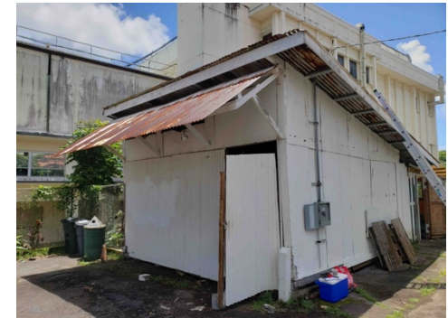
The old police chief's garage, just before EHCC moved its gamelan into the space.

Currently, stink maile ( Paederia foetida ) and other vines creep in behind the plywood interior walls, stray cats frequently urinate throughout the space, and chickens even nest among the instruments, rendering the space odiferous and impossible to keep clean and sanitary. Because the