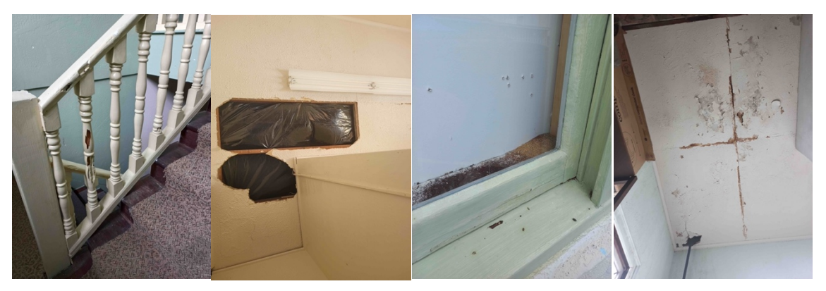
Damage in the main building, from left: termite-damaged banister; holes in ceiling of archive room; termite frass behind the gallery wall; water damage on the ceiling of the dressing room.

The purpose of the Phase 1 improvement project is to begin making EHCC a safer, more inviting venue for the public we serve.