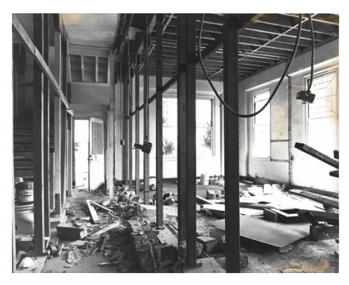
Interior of old police station as it looked when EHCC leased it from the County.

In 1967, a loose coalition of community art and drama groups formed the East Hawaii Cultural Council (now using the trade name East Hawaiii Cultural Center) to share resources. Over time, EHCC became a distinct institution, gaining 501c3 status in 1979 and transforming from an informal group to an established organization in its own right.