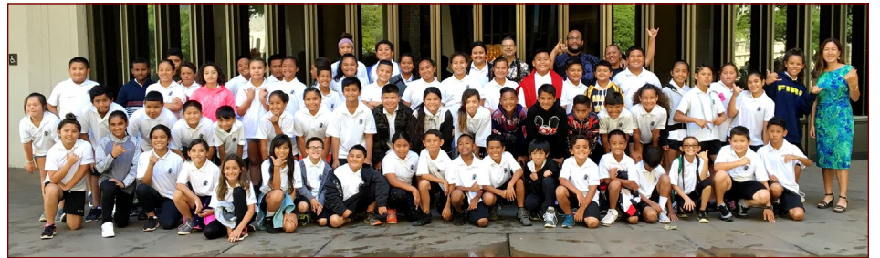
Fifth graders from Ka Wai'hona o Ka Na'auao, a Hawaiian-focused public charter school, visited the Capitol.