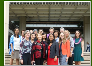
Women's Legislative Caucus