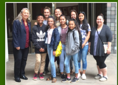
Lanai Students visiting the Capitol