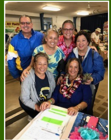
At the Haiku Hoolanlea Flower Festival

TOTAL FUNDING FOR DISTRICT 13 FOR 2018-2019: $224,763,000