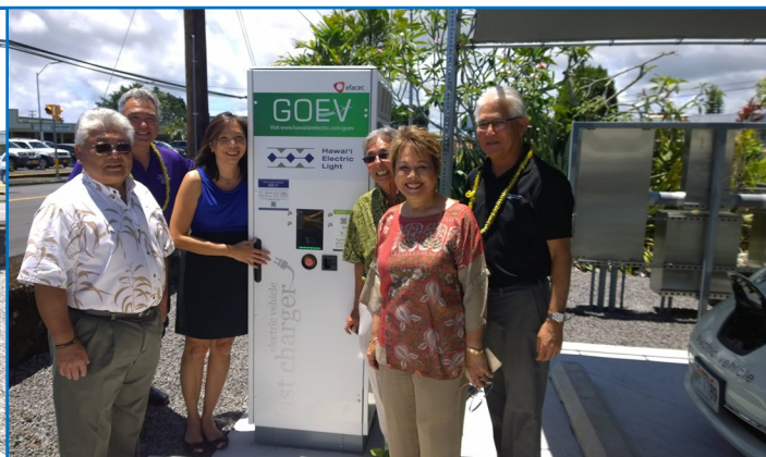
At HELCo's blessing of the only level 3 fast charge station in east Hawaii. Photo on right is the payment slot, $7.00 for an EV charge. It should take only 1/2 hour to fully charge an electric vehicle making the time similar to gas up a regular car.