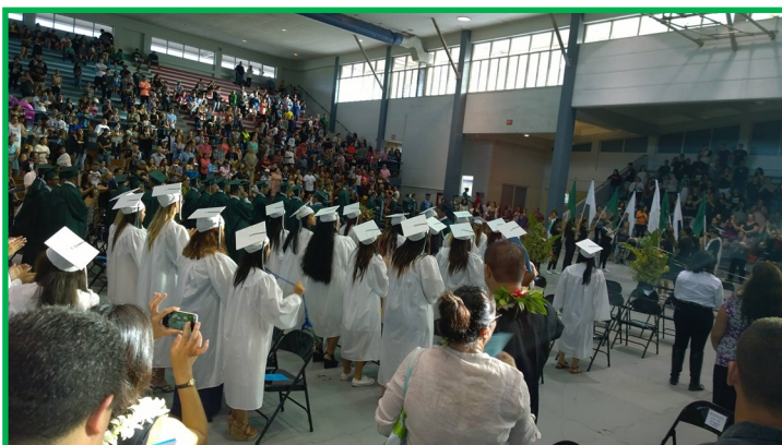
Congratulations to Pahoia High School class of 2016!!