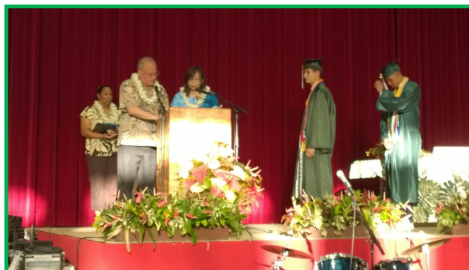
Pahoia High School graduation, where Senator Ruderman graciously allowed me to present Senate Certificates.