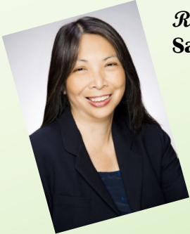
Representative San Buenaventura