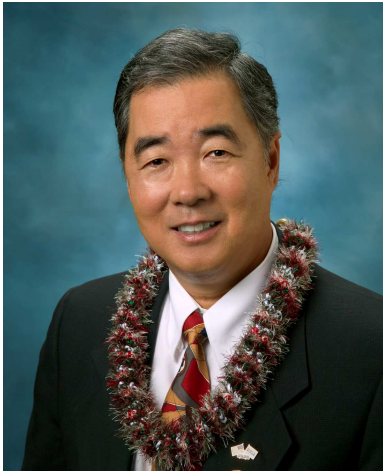
Senator Norman Sakamoto 415 S. Beretania Street State Capitol Room 230 Honolulu, HI 96813