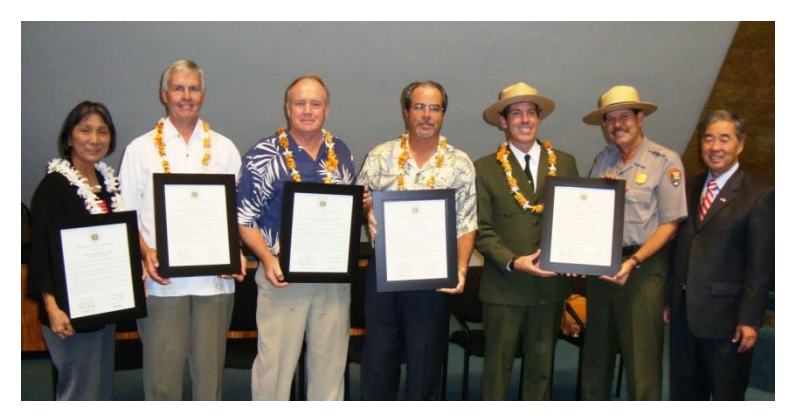
The Legislature honored the Pearl Harbor Historic Sites Partners and commemorated the 65<sup>th</sup> Anniversary of the end of World War II during floor presentations in the House and Senate.