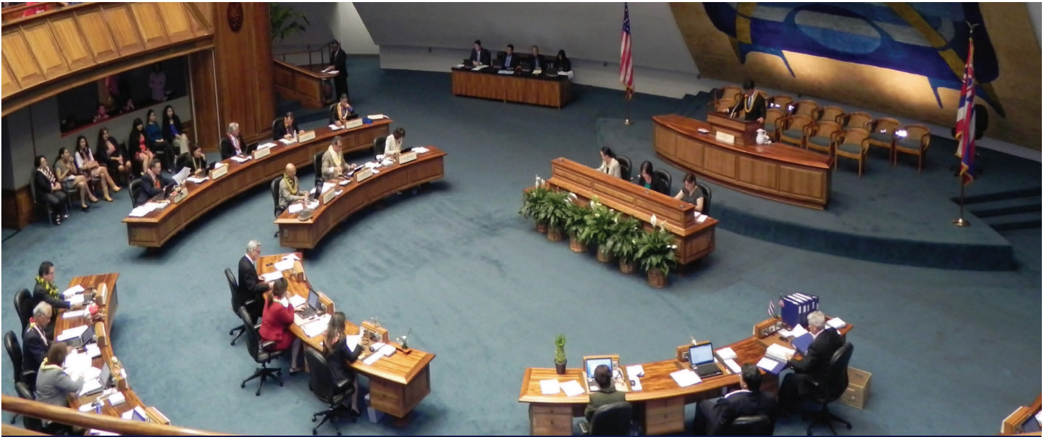
Photo taken from the gallery of the Hawaii State Senate Chambers on May 3, 2012, Sine Die.

The Senate also continues its strong support for education. Notably, the Senate has underscored education as a top priority. Through the State Budget, key areas of investment were made in the student weighted formula, student meals, Community Schools for Adults and student transportation.