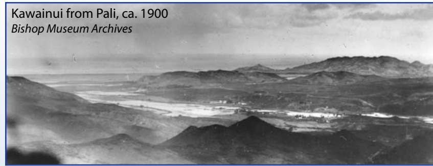
Kawainui from Pali, ca. 1900 Bishop Museum Archives