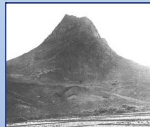
Rice in Maunawili, ca 1930