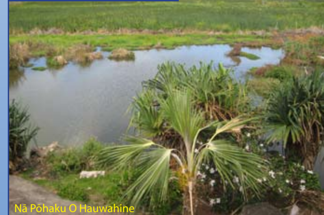
Nā Pōhaku O Hauwahine