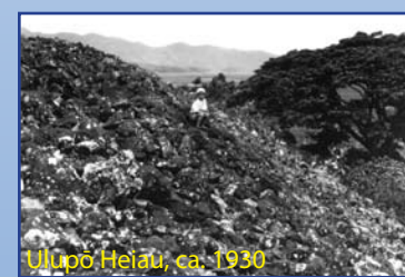
Ulupō Heiau, ca. 1930