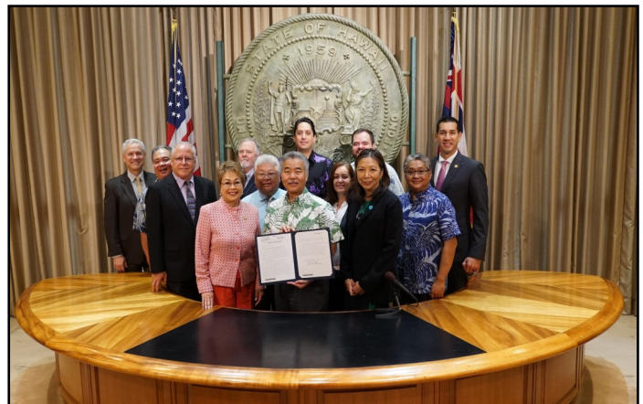
Governor Ige signs Hawai'i Island Natural Disaster Bill