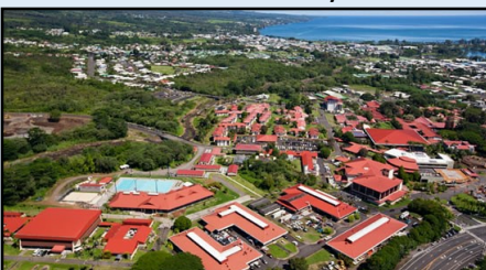
University of Hawai'i at Hilo