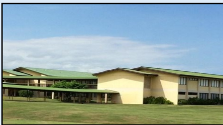
Waiākea Elementary School