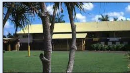
Keaukaha Elementary School