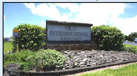
Hilo International Airport