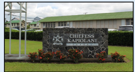
Kapi'olani Elementary School