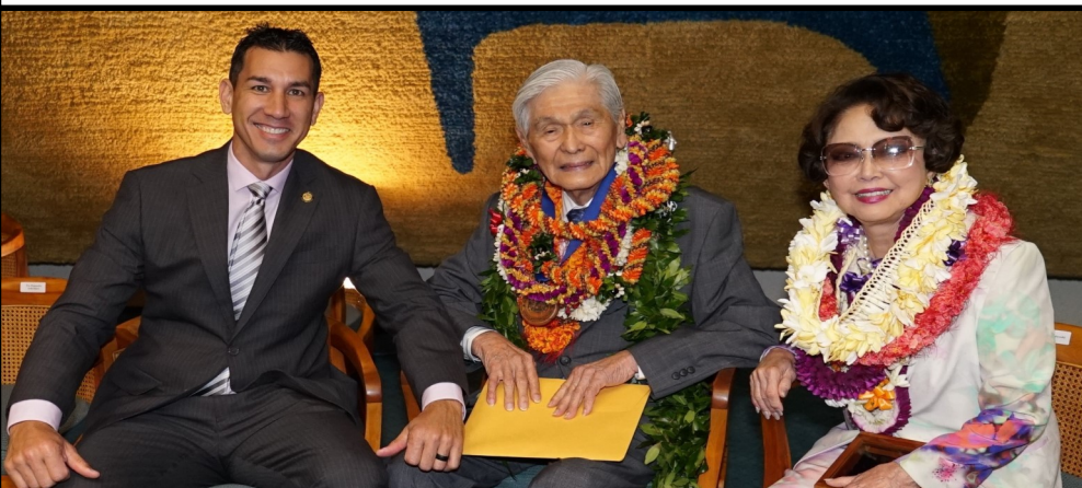
Former Governor George Ariyoshi inducted into the Aloha Order of Merit L-R: Sen. Kaiali'i Kahele, Former Gov. George Ariyoshi and Former First Lady Jean Ariyoshi

Senate District 1- Hilo Majority Floor Leader Chair, Senate Committee on Water and Land