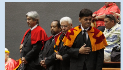
Royal order of Kamehameha