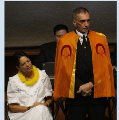
Being Honored in the Senate Floor

Kumu, mahalo nui for perpetuating Hawaiian culture and traditions for future generations