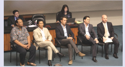
Being Honored in the Senate Floor