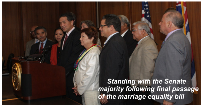
Standing with the Senate majority following final passage of the marriage equality bill