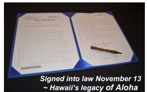
Signed into law November 13 ~ Hawaii's legacy of Aloha