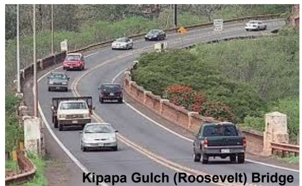
Kipapa Gulch (Roosevelt) Bridge

Drivers welcomed the new structure with joy because it saved them the tedious drive on the long and winding surface road through the gulch. It will be even better in a few years when it’s expanded from two to four lanes!