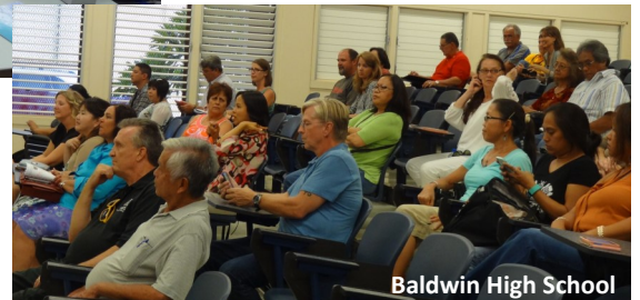
Baldwin High School