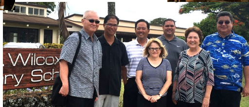
Wilcox Elementary School