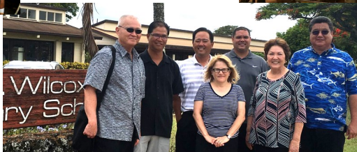
Wilcox Elementary School