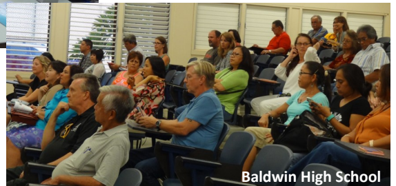
Baldwin High School