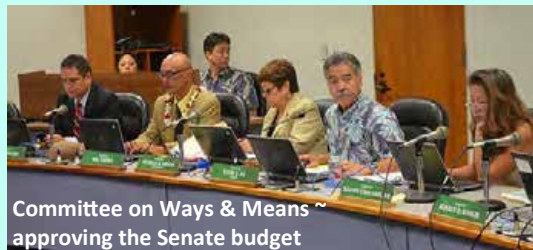
Committee on Ways & Means ~ approving the Senate budget

As this newsletter is being printed and distributed to our neighborhood boards this week, many decisions on the state budget have yet to be finalized. I can report that the Senate Ways and Means Committee and the House Finance Committee both worked hard to establish budget priorities and act with caution in the face of new evidence that what the administration