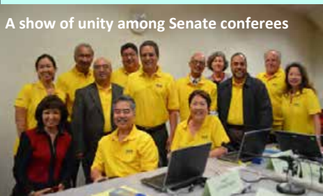
A show of unity among Senate conferees

I will be reporting on the Legislature's final budget decisions in my coming MidWeek columns and in future issues of this newsletter. Thank you for your continued input on how we can best meet the needs of our communities.