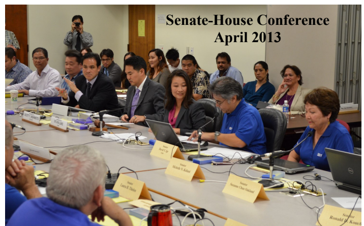
Senate-House Conference April 2013