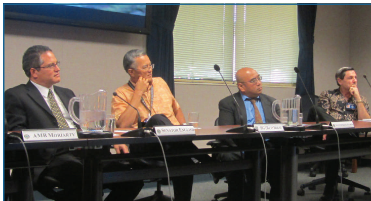
(From left to right) Senator English, Brig. Gen. (Ret.) Hirai, Senator Keith-Agaran, and Deputy Dean Shanahan participate in a discussion of security issues at the Asia-Pacific Center For Security Studies.

With regard to the unemployment insurance tax, SB 1272 SD1 fast-tracks relief for employers with a tax break from the scheduled unemployment insurance tax hikes in 2013 and 2014. This bill is projected to save businesses $66 million in 2013 alone. SB 331 SD2 increases the minimum hourly wage incrementally until January 2016, when it would reach $9.25. At that point, the bill authorizes the Department of Labor and Industrial Relations to make further adjustments to the minimum wage based on inflation without obtaining legislative approval. The Hawaii State Legislature has not raised the Hawaii's minimum wage since 2005, and it is currently equal to the federal minimum wage despite the fact that Hawaii has a higher cost of living than any other state.