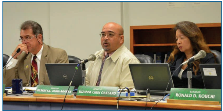
The Senate Committees on Tourism and Hawaiian Affairs and Ways and Means held a hearing on SB1201, relating to the transient accommodations tax.

To improve the quality of health care services and operational efficiencies of health facilities, SB 1306 SD2 would permit the regional systems of the Hawaii Health Systems Corporation and their health facilities to transition to non-public status. This measure would help address financial challenges of the public hospitals, including Maui Memorial Medical Center, Lanai Community Hospital, and Kula Hospital. SB 665 SD1 is another measure that's expected to ensure quality of health care services. The bill addresses the primary care physician shortage in the State through a comprehensive primary care workforce development plan that includes loan repayment, diversity programs, and primary care workforce expansion. A cou-