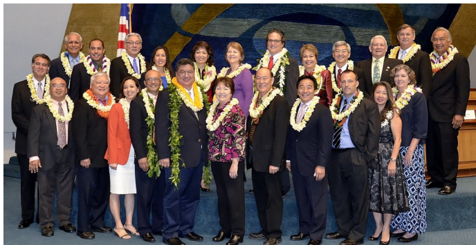
The Hawai'i State Senate adjourned on May 7, 2015.