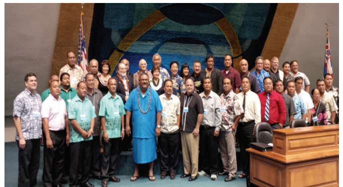
Senator Kahele attends the Opening Ceremony of the 32nd General Assembly. Governor Abercrombie, Senate President Mercado Kim and Speaker Souki welcomed the delegates.

The Hawai'i State Legislature was honored to host the APIL's 32nd General Assembly. The theme of this conference was on alternative renewable energy and affordable health insurance for our Pacific Communities.