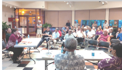
Senator Solomon concludes the meeting with hopeful remarks of moving Hawai'i Island forward.