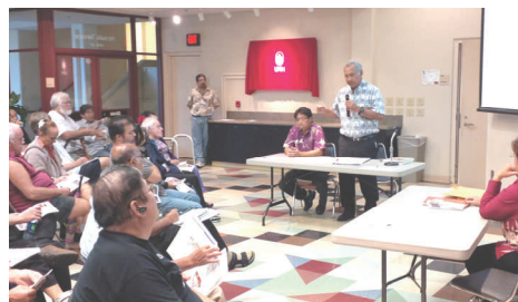
Senator Kahele presents his portion of the meeting, specifically speaking on the future of aviation sciences at UH-Hilo and HawCC.

Amongst the array of projects and initiatives that were discussed, the Legislators touched upon several specific topics like education, healthcare, agriculture, and infrastructure.