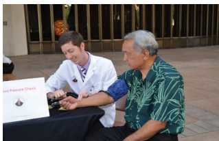
Free blood pressure checks were conducted by UH Hilo Daniel K. Inouye College of Pharmacy students.

Monday, March 18th was 'Early Education in Hawai'i: What's at Stake?' with the Executive Office on Early Learning spearheading a talk story session with educational leaders and early learning advocates.