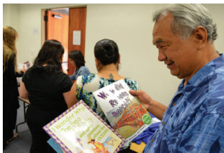
Senator Kahele stopped by the book sale and purchased a few books for his grandchildren.