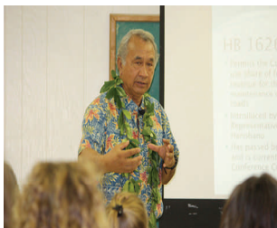
Senator Kahele addresses the audience

Also announced at the community forums was the addition of the medical mobile van which will be coming soon to the Island of Hawai'i. The purpose of this innovative project is to provide healthcare to remote and underserved rural communities. Don't be surprised if you see the medical mobile van in South Kona and Ka'u in the near future.