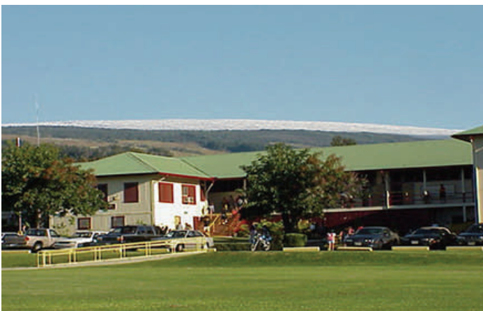
Kau High School

sustainable agricultural endeavors in Ka'u. The planning and design phase is currently underway and Senator Kahele will be looking to secure future funding of the actual construction of the project in the upcoming legislative session.