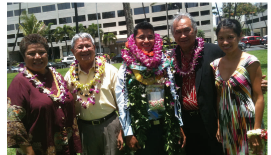
UH JABSOM graduation