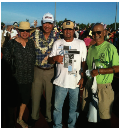
Kea'au High School graduation