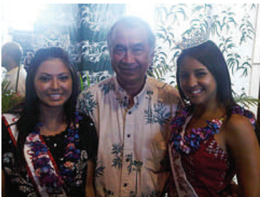
UH Hilo graduation with Miss Aloha Hawaii and Miss Filipina.

May was a month of graduations in the district as students at the high school, college, and graduate school level took the next step in their lives. I am proud of all they have accomplished to this point and I am looking forward to the bright futures that they face as they continue to grow and contribute to our community.