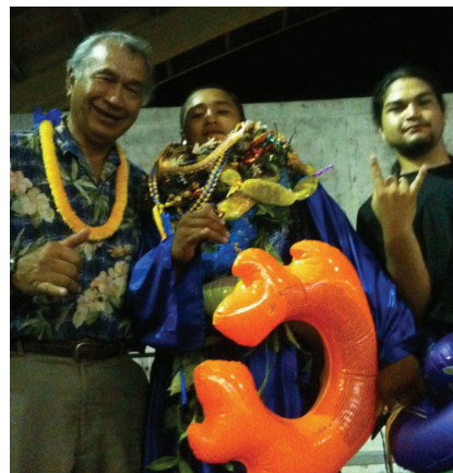
Hilo High School graduation