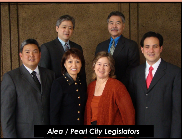
Aiea / Pearl City Legislators