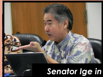
Senator Ige in WAM hearing