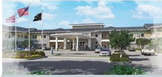
Pictured: street view rendering, courtesy of MGA

grant from the U.S. Department of Veterans Affairs and received $53.7 million in state funds for planning, design, construction and equipment.