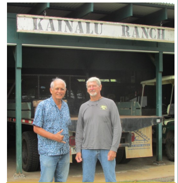
Sen. Gabbard took a tour of Kainalu Ranch on Moloka'i on Feb. 28 with owner, Kip Dunbar.

Kainalu Ranch has been run by owner Kip Dunbar's family for 100 years. The family originally grew pineapple on the 1,200-acre property before switching to raising cattle. Kip wants to work on a market for venison in the future to address Moloka'i's massive deer problem.