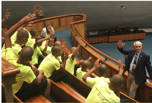
Sen. Gabbard spoke to cadets from Class 46 of the Hawai'i Youth Challenge Academy O'ahu during a tour of the Hawai'i State Capitol on Feb. 13.

I encourage you to visit capitol.hawaii.gov to track the bills you're interested in and weigh in when you can, either by submitting written testimony, or by showing up in person to testify. As always, please feel free to contact me at 586-6830 or sengabbard@capitol.hawaii.gov if I can help you or your family in any way. You can also follow me on Twitter @senmikegabbard, Instagram @sengabbard, or Facebook at www.facebook.com/senmikegabbard .