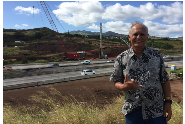
Sen. Gabbard has been working with other Kapolei area legislators, the Department of Transportation, and the James Campbell Company to make sure Phase 2 of the Kapolei Interchange project stays on track.