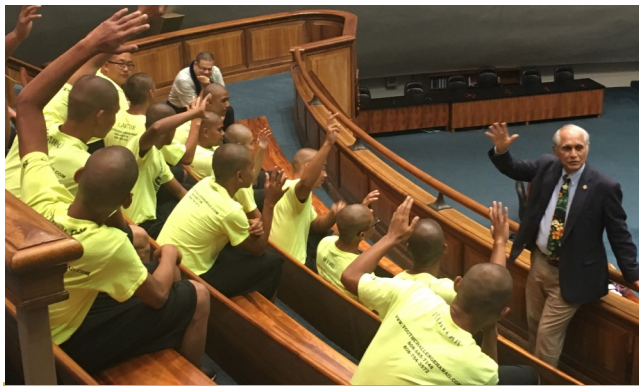
Sen. Gabbard spoke to cadets of the Youth Challenge Academy during their tour of the Hawai'i State Capitol February 13.