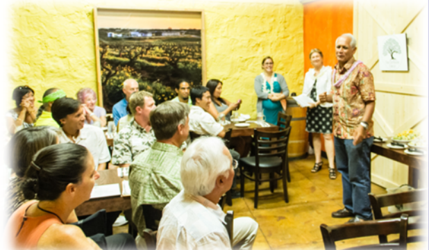
Senator Gabbard attended a luncheon and spoke at the "Outdoor Circle Celebration Party" for the Passage of SB 632, establishing environmental courts.

Another big factor in passing SB 632, in my opinion, is that we had several high profile environmental events that were in the minds of the public and especially legislators. These issues included illegal dumping in Wai'anae, the Matson molasses spill, the Navy jet fuel spill at the Red Hill Underground Fuel Storage Facility, and the discovery of Little Fire Ants in Waimanalo. All in all, in the short and long term, the Environmental Court will be a very good thing for our island home.