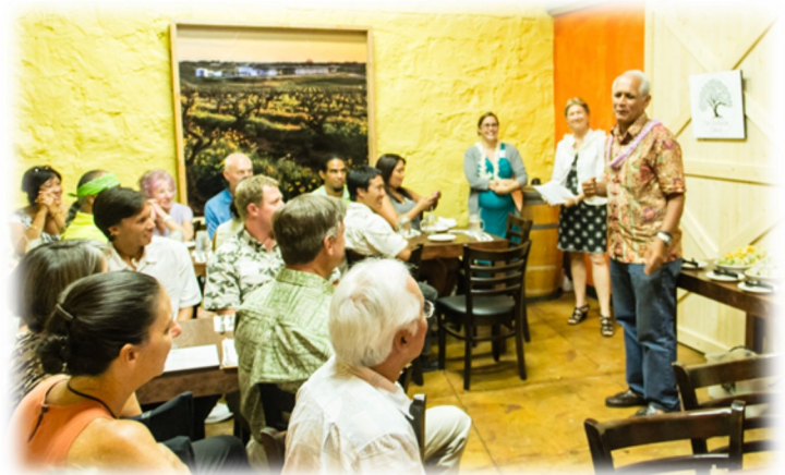
Senator Gabbard attended a luncheon and spoke at the "Outdoor Circle Celebration Party" for the Passage of SB 632, establishing environmental courts.

Another big factor in passing SB 632, in my opinion, is that we had several high profile environmental events that were in the minds of the public and especially legislators. These issues included illegal dumping in Wai'anae, the Matson molasses spill, the Navy jet fuel spill at the Red Hill Underground Fuel Storage Facility, and the discovery of Little Fire Ants in Waimanalo. All in all, in the short and long term, the Environmental Court will be a very good thing for our island home.